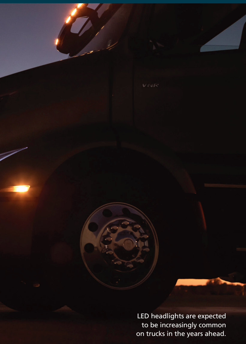
LED headlights are expected to be increasingly common on trucks in the years ahead.