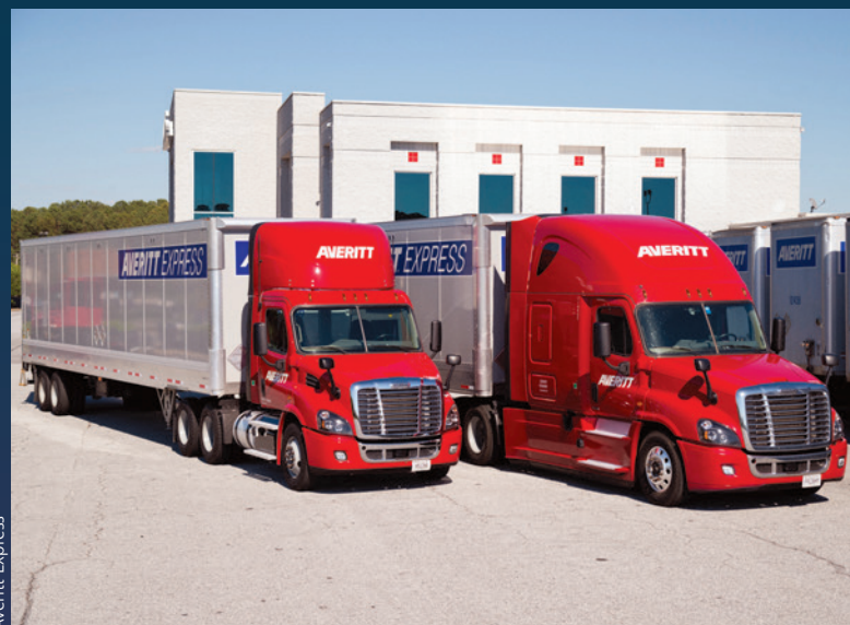
Averitt Express uses LED lighting across its entire fleet of less-than-truckload and over-the-road tractors and trailers.

Aside from the general costs of parts and labor in maintaining and replacing traditional lights, tractors would ordinarily be pulled out of service for changing and maintaining lights, Lloyd said. Now, with the longer-lasting LED lights, Averitt can avoid those setbacks and reduce the potential costs of delaying drivers and shipments.