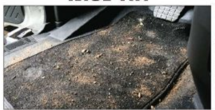
Typical worthless floor mats Guaranteed to fail