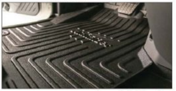
Custom Molded Floor Mats Guaranteed for Life!