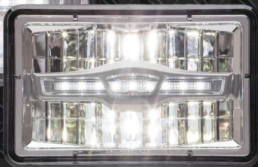
HLL78LB Low Beam