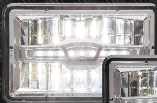
HLL79HB High Beam

4"x6" High and Low Beam Sealed LED Headlamps