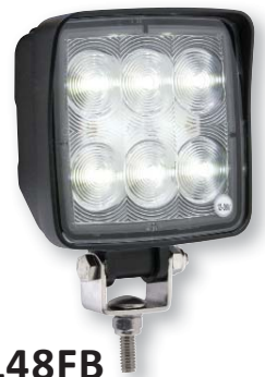
TLL48FB 12/24VDC 1440/1036 lumens 6-LED, flood beam 4.15" x 6.375" x 2.14"