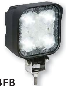
TLL64FB 12/24VDC 3200/2240 lumens 4-LED, flood beam 4" x 6.5" x 3"