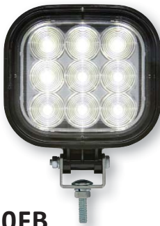
TLL50FB TLL150FSL ( retail box ) 12/24VDC 324/252 lumens 9-LED, flood beam 5" x 7" x 2.375"