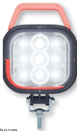
TLL73FB 12/24VDC 2160/1490 lumens 9-LED, wide flood beam Built-in handle 5" x 7.5" x 3.25"