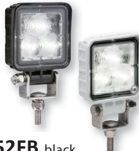
TLL52FB black TLL152FSL ( retail box ) TLL52FWB white 12/24VDC 720/464 lumens 3-LED, flood beam 2.75" x 5" x 1.687"