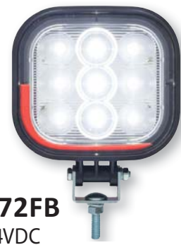
TLL72FB 12/24VDC 2160/1490 lumens 9-LED, wide flood beam 5" x 5.813" x 2.25"