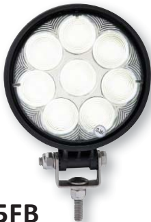
TLL45FB 12/24VDC 1920/1295 lumens 8-LED, flood beam 4.5" x 7" x 2"