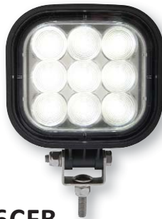
TLL46CFB 12/24VDC 2160/1492 lumens 9-LED, flood beam 5" x 7" x 2.375"