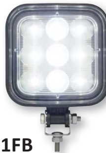
TLL71FB 12/24VDC 2160/1490 lumens 9-LED, wide flood beam 4" x 5" x 2.25"