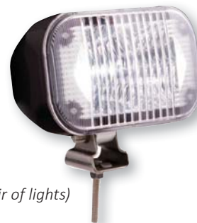
DLL50CC (pair of lights) TLL25FS (retail clam) 12/24VDC 440/396 lumens 2-LED, wide low beam 5" x 4" x 3.5"