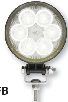
TLL44FB TLL144FSL ( retail box ) 12/24VDC 1440/1028 lumens 6-LED, flood beam 4.5" x 7" x 2"