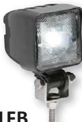
TLL51FB TLL51FRPG (.180 male bullet on power) 12/24VDC 800/560 lumens 1-LED, flood beam 2" x 3" x 2.5"