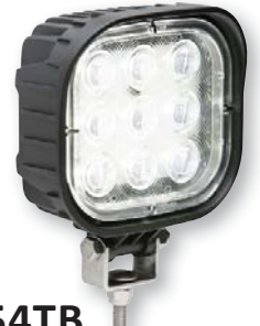
TLL54TB 12/24VDC 2160/1484 lumens 9-LED, spot beam 5" x 7" x 2.375"