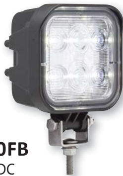
TLL70FB 12/24VDC 4800/3360 lumens 6-LED, wide flood beam 5" x 4.375" x 2.625"