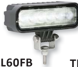
TLL60FB 12/24VDC 1440/865 lumens 6-LED, flood beam 6" x 4.5" x 2.4"