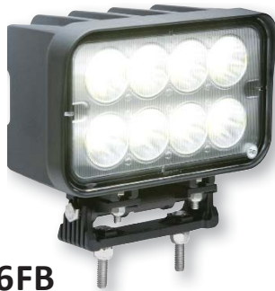
TLL56FB TLL57FB shock mount 12/24VDC 4000/2800 lumens 8-LED, flood beam 7" x 9" x 4.313"