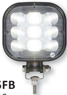
TLL55FB 12/24VDC 2160/1510 lumens 9-LED, wide flood beam 4.87" x 6.90" x 2.03"