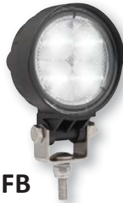
TLL30FB TLL30FPG ( Deutsch connector ) 12/24VDC 960/670 lumens 4-LED, flood beam 3.27" x 5.7" x 2.36"

The Effective lumens is an actual measurement of light output that takes into account thermal losses, current used to drive the LEDs, optical losses, and assembly variations. Measuring the effective lumen output of a light requires the use of high-tech photometry equipment.