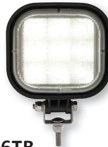
TLL46TB 12/24VDC 2160/1346 lumens 9-LED, trapezoid beam 5" x 7" x 2.375"